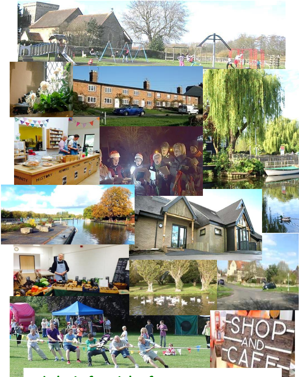
A brief guide for newcomers

Welcome to the village of Sandford -on-Thames. This leaflet has been put together by St Andrew's Church in the hope it will help newcomers settle into the village more quickly, and give some idea of the various groups and activities that go on here.